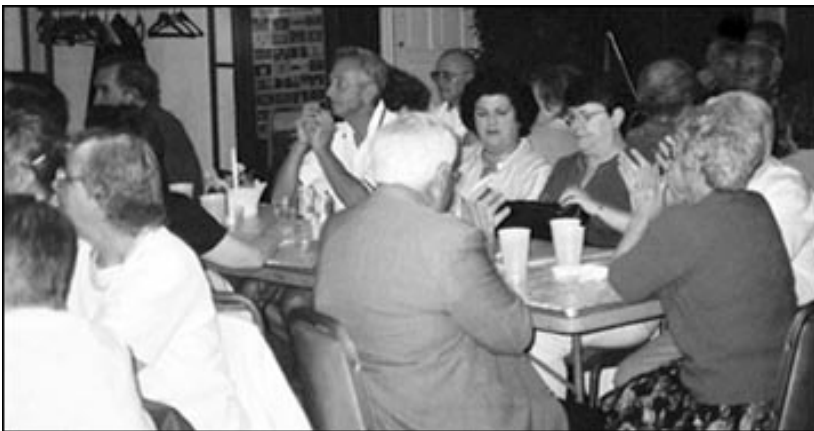
Eighty Shamrock Club members attended the 2004 installation ceremonies.