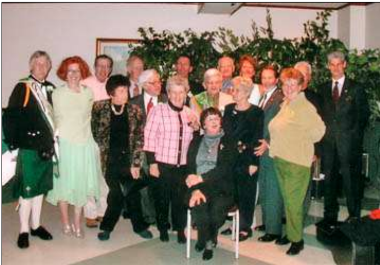
A crowd gathers for the camera.