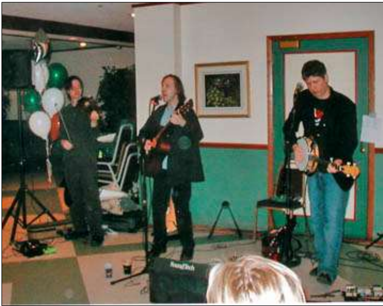
The Tynkr Boys provided ballads and lively Irish music during the final portion of the evening.