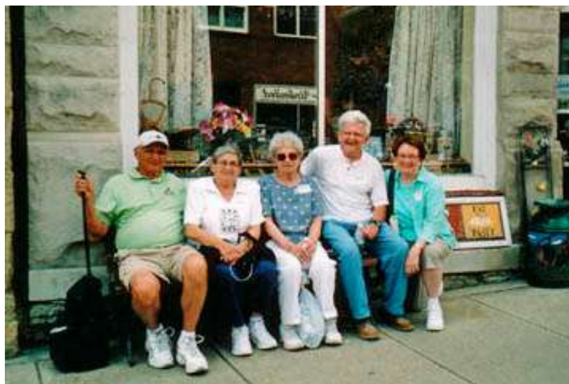
Members of the Milwaukee chapter recently enjoyed a trip